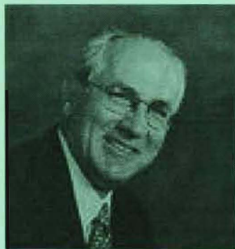
State Senator—Tom Harman